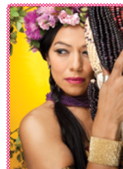
Exhibit Opening Free and Open to the Public

Proceeds from the concert will benefit the Allen Downs Moving Image Fellowship